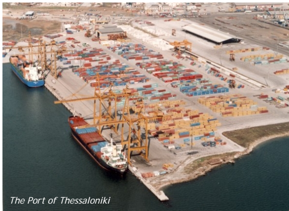
The Port of Thessaloniki