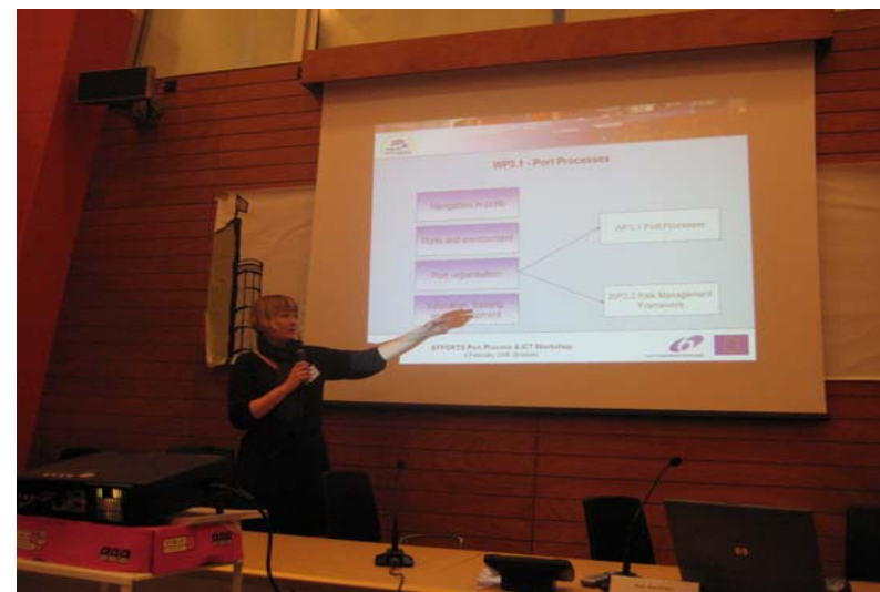
Brief Introduction about SP 3 Port Organization