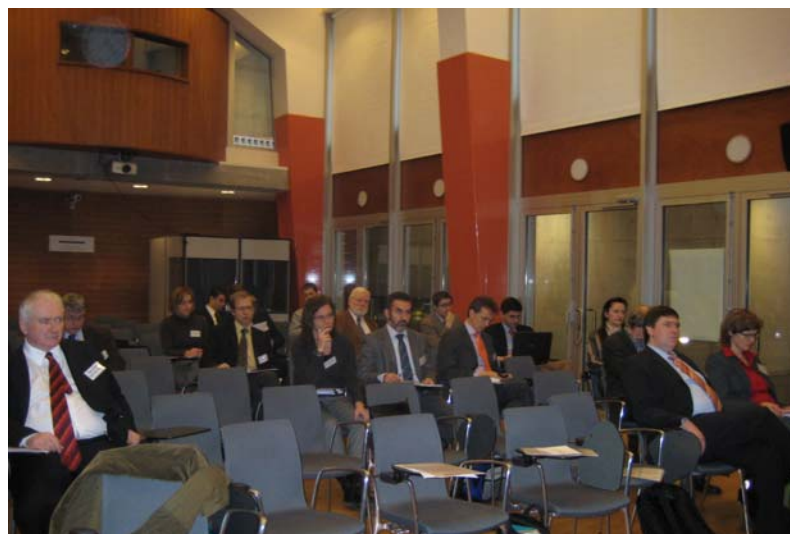
The Workshop Participants